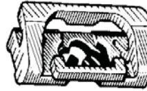
465145 H-0015609 Plastic Windshield Reveal Moulding Clip Mazda 626 '83 - UP Box Qty. 25