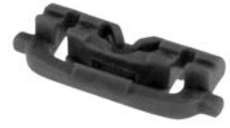
465150 B092-50-609 Gray Plastic Back Glass Moulding Clip Ford Probe '88 - UP, Mazda MX6 '88 - UP, Mercury Tracer '87 - UP Box Qty. 25