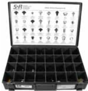
222534 Oil Drain Plug & Gasket Assortment 2 32 Varieties / 93 Pieces