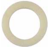
* Teflon coated steel

On vehicles equipped with aluminum gaskets, a new aluminum gasket must be installed at each oil change.