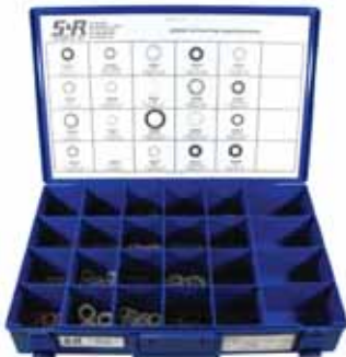
222535 Oil Drain Plug Gasket Assortment 20 Varieties / 200 Pieces