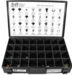
222530 Oil Drain Plug & Gasket Assortment 12 Varieties / 76 Pieces