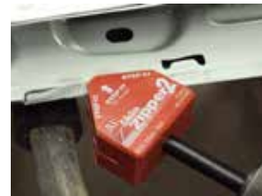
Step #2 Finish crimp.