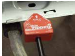
Step #1 Form edge of door skin to 45 degrees