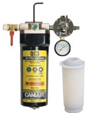
9710 DeVilbiss 3 Stage Desiccant Filter/Dryer 9711 Replacement Filter Cartridges