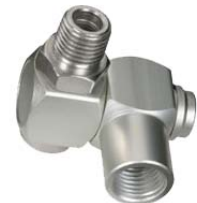
4086 1/4" NPT Swivel Connector Bx. Qty. 1