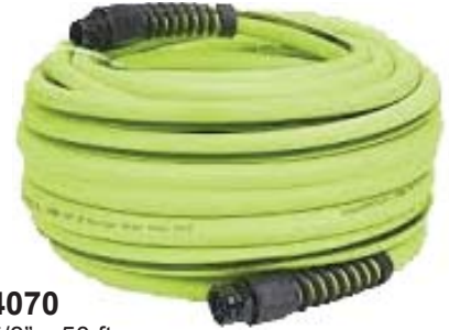
4070 5/8" x 50 ft. Flexzilla Garden Hose Box Qty. 1

FLEXZILLA® is a revolutionary hose featuring a Premium Hybrid Polymer material that redefines flexibility. Flexzilla® hose characteristics offer zero memory allowing it to lay-flat exactly where you drop it and will not work against you during operation or coiling after use. Extreme all-weather flexibility. Kink resistant under pressure. Excellent abrasion-resistant outer cover. Flexzilla® Hi-Vis color, safety green, makes hose more visible in the workplace. Includes bend restrictors that reduces wear and tear, prolonging the life of the hose. Anodized aircraft aluminum ends. Drinking water safe! This hose is field repairable! Maximum Working Pressure: 150 PSI