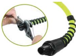
4084 Reusable End Used With 3/8" Flexzilla Pro Box Qty. 1