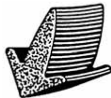
5012 Door Flange Weatherstrip All Chrysler Products 1950 - '54. Ford 1950 - '58 25 Ft.