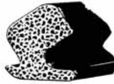
5002 Trunk And Rear Deck Gutter Weatherstrip GM And Universal 25 Ft.