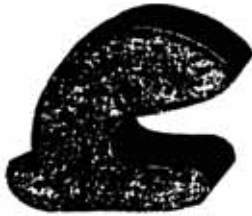
5001 Trunk Weatherstrip Universal 35 Ft.

EPDM NEOPRENE BLEND CLOSED CELL -- LIGHT WEIGHT -- WEATHER RESISTANT.