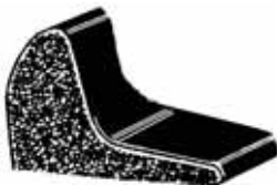
5014 Door Flange Weatherstrip All GM Cars 1953 & '54 Also General Purpose 25 Ft.