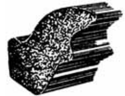
5005 Deck Lid Weatherstrip GM Cars 1956 - UP 25 Ft.