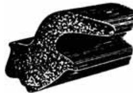
5007 C5AZ-6243720-B Deck Lid Weatherstrip Ford 1956 - UP 25 Ft.